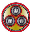
Three Core XLPE Tape