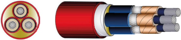
Three Core Paper Single Lead

Compliant with standards CENELEC HD 629.2 S2, CEI 20-62/2