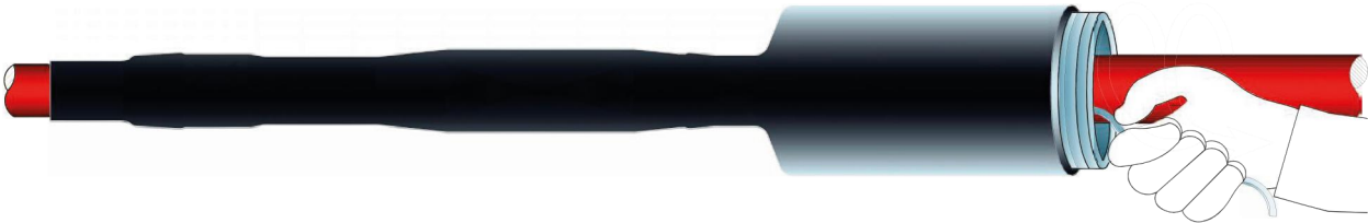
Single Core Paper Lead

List of kits available for use with crimp connectors. Connectors not included.